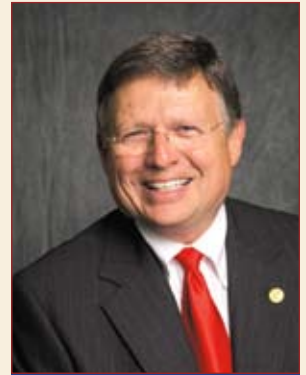
Rep. Chuck Hopson