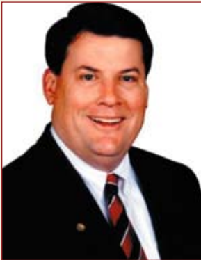
Sen. Tommy Williams

strength of a particular political party ensures that the winner of the primary prevails in the general election.